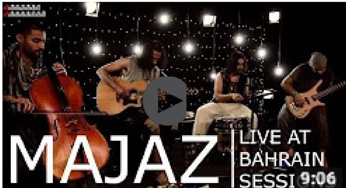
Saraab (Live at Bahrain Sessions)