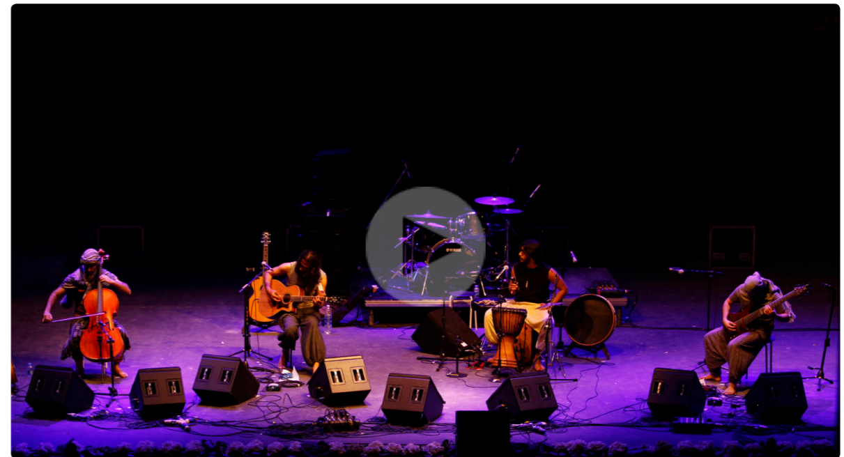
Mashujaa Wa Jangwa (Live at Spring of Culture, Bahrain)